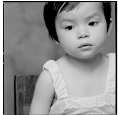
mei mei 99 Limited Edition Print 20" x 20" $250.00 unframed $450.00 framed