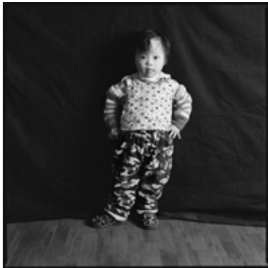
mei mei 72 Limited Edition Print 20" x 20" $250.00 unframed $450.00 framed