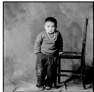
mei mei 31 Limited Edition Print 20" x 20" $250.00 unframed $450.00 framed