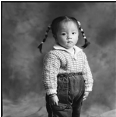
mei mei 25 Limited Edition Print 20" x 20" $250.00 unframed $450.00 framed