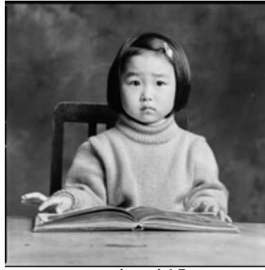
mei mei 15 Limited Edition Print 20" x 20" $250.00 unframed $450.00 framed