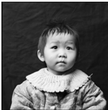
mei mei 31 Limited Edition Print 20" x 20" $250.00 unframed $450.00 framed