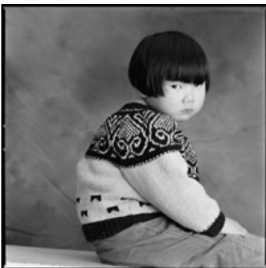
mei mei 107 Limited Edition Print 20" x 20" $250.00 unframed $450.00 framed