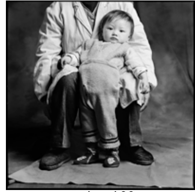
mei mei 23 Limited Edition Print 20" x 20" $250.00 unframed $450.00 framed