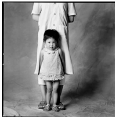
mei mei 83 Limited Edition Print 20" x 20" $250.00 unframed $450.00 framed