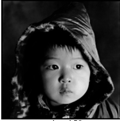
mei mei 50 Limited Edition Print 20" x 20" $250.00 unframed $450.00 framed