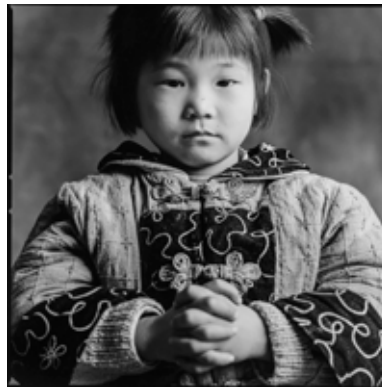
mei mei 55 Limited Edition Print 20" x 20" $250.00 unframed $450.00 framed