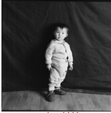
mei mei 111 Limited Edition Print 20" x 20" $250.00 unframed $450.00 framed