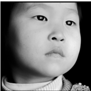
mei mei 16 Limited Edition Print 20" x 20" $250.00 unframed $450.00 framed