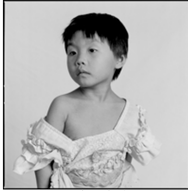
mei mei 125 Limited Edition Print 20" x 20" $250.00 unframed $450.00 framed