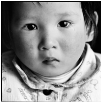
mei mei 123 Limited Edition Print 20" x 20" $250.00 unframed $450.00 framed