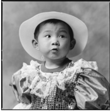
mei mei 59 Limited Edition Print 20" x 20" $250.00 unframed $450.00 framed