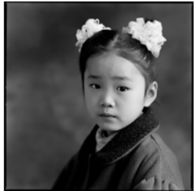
mei mei 127 Limited Edition Print 20" x 20" $250.00 unframed $450.00 framed