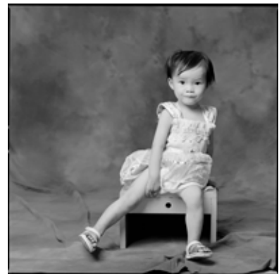
mei mei 131 Limited Edition Print 20" x 20" $250.00 unframed $450.00 framed