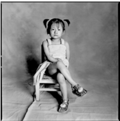
mei mei 133 Limited Edition Print 20" x 20" $250.00 unframed $450.00 framed