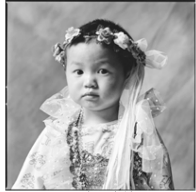
mei mei 48 Limited Edition Print 20" x 20" $250.00 unframed $450.00 framed