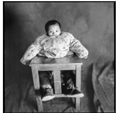
mei mei 93 Limited Edition Print 20" x 20" $250.00 unframed $450.00 framed