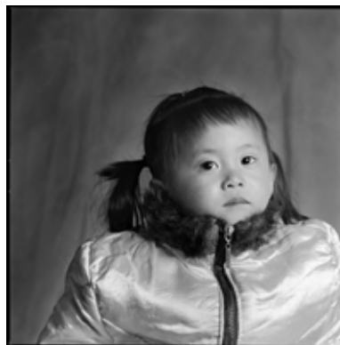
mei mei 108 Limited Edition Print 20" x 20" $250.00 unframed $450.00 framed