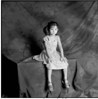
mei mei 63 Limited Edition Print 20" x 20" $250.00 unframed $450.00 framed