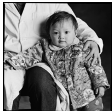
mei mei 117 Limited Edition Print 20" x 20" $250.00 unframed $450.00 framed