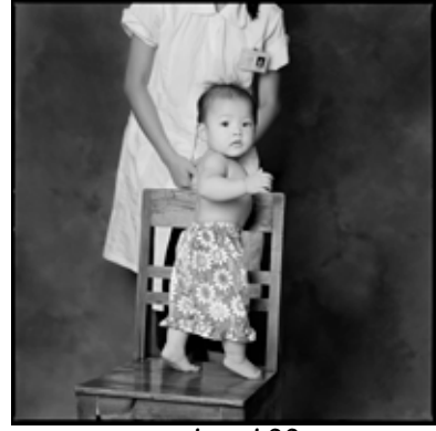
mei mei 22 Limited Edition Print 20" x 20" $250.00 unframed $450.00 framed