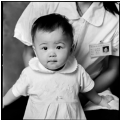
mei mei 121 Limited Edition Print 20" x 20" $250.00 unframed $450.00 framed