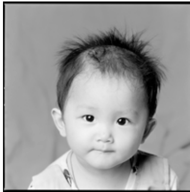
mei mei 90 Limited Edition Print 20" x 20" $250.00 unframed $450.00 framed