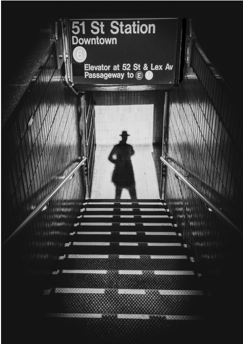
“Lurking” by J.S.Cela