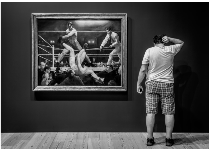
“Palooka” by J.S.Cela