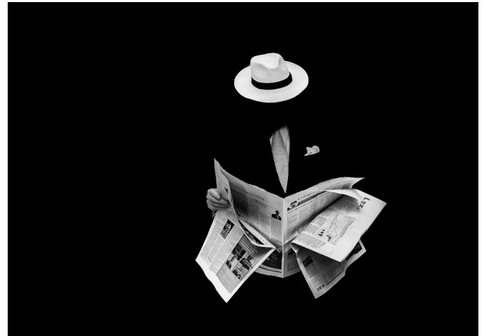
“Out of the Shadows” by J.S.Cela